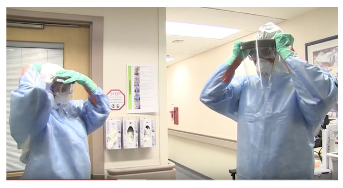
Fig. 1 Example of enhanced droplet/airborne personal protective equipment for intubation of patient with suspected or confirmed novel coronavirus (2019-nCoV) incorporating fit-tested N95 mask. Healthcare staff preparing to enter a room to intubate a patient with suspected or confirmed 2019-nCoV. Note use of fluid-resistant gown, covering of head and neck plus face shield to minimize skin exposure

to droplet contamination. Additional eye protection worn under the face shield may help to avoid conjunctival exposure from spray around the shield. Fit-tested N95 mask is worn to protect against inhalation of airborne virus. Strips of tape securing gloves to the gown help prevent gloves from slipping during patient care and exposing wrists to contamination