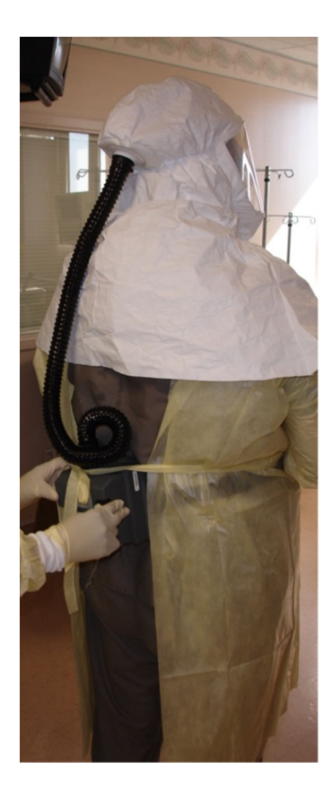
Fig. 2 Example of enhanced droplet/airborne personal protective equipment incorporating use of powered air purifying respirator (PAPR) for intubation of a simulated patient with 2019-nCoV. Healthcare staff wearing PAPR blower unit with incorporated filter on belt (rear view on left), attached to full hood with hose. Gown and gloves used to avoid droplet or contact contamination. Note that in this case, a fit-tested N95 respirator is being worn under the PAPR hood to protect against inhalation of airborne viral particles during removal of personal protective equipment (PPE), helpful in settings without appropriate individual airborne isolation rooms with anterooms

to droplet contamination. Additional eye protection worn under the face shield may help to avoid conjunctival exposure from spray around the shield. Fit-tested N95 mask is worn to protect against inhalation of airborne virus. Strips of tape securing gloves to the gown help prevent gloves from slipping during patient care and exposing wrists to contamination